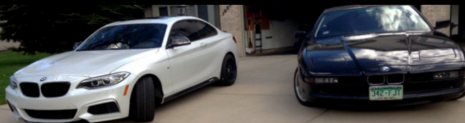
2014 BMW M235